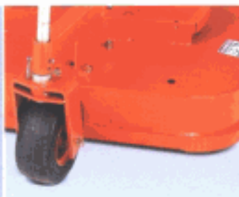
5.5" deep mower deck