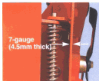
7-gauge (4.5mm thick)

A durable, hard-working deck that's ready for a wide range of mowing jobs.