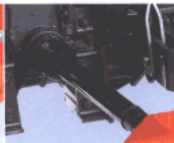
PTO shaft drive