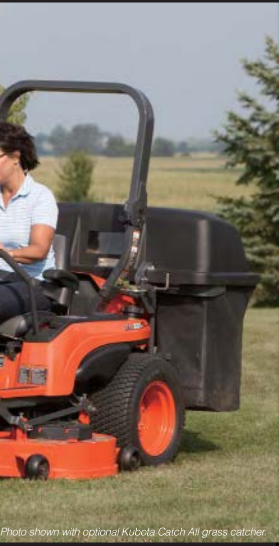
Photo shown with optional Kubota Catch All grass catcher.