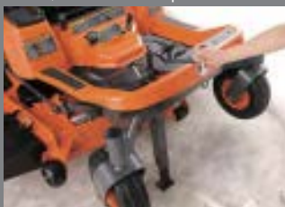
Maintenance Lift (Optional)

Maintenance doesn't get any easier. The seat panel lifts up for quick access to the HST, the hood opens for routine maintenance (adding oil, etc.), an operator platform hatch makes upper mower access a snap—and all three can be opened at once. Plus, Kubota's optional tilt-up lift feature is also available for routine maintenance underneath the mower.