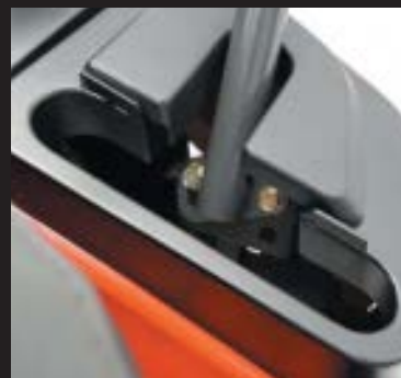
Adjustable Speed Control Levers