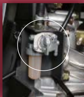
Carburetor Drain Cock*

*When in use, consult operator manual and handle with care.