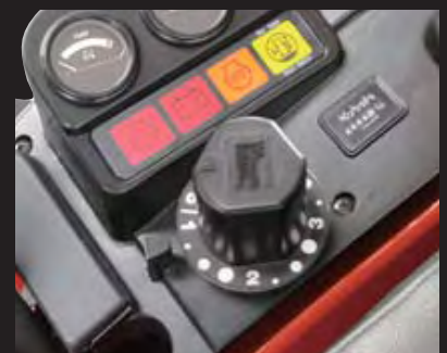
1/4" Increment Cutting Height Adjustment