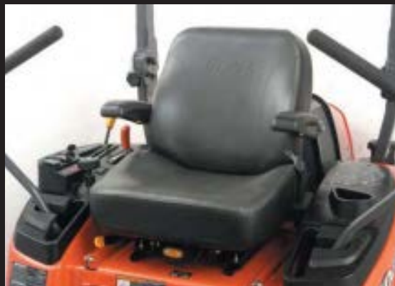
Suspension Seat Adjustment Lever