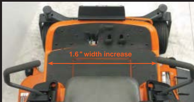
Full-Flat Operator Platform