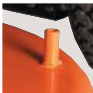
Deck cleaning pipe for connecting water hose