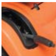
Gas-assisted mower lift lever