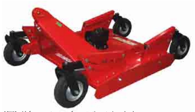
MX60 with four puncture proof pneumatic castoring wheels

Heavy weight single rotor for slim and narrow vineyards. MX standard features are four heavy duty axe head flails on a circular double clevis flail carrier and friction clutch. The MX series are available in a wide variety of "set up" options to customize to your vineyard and conditions.