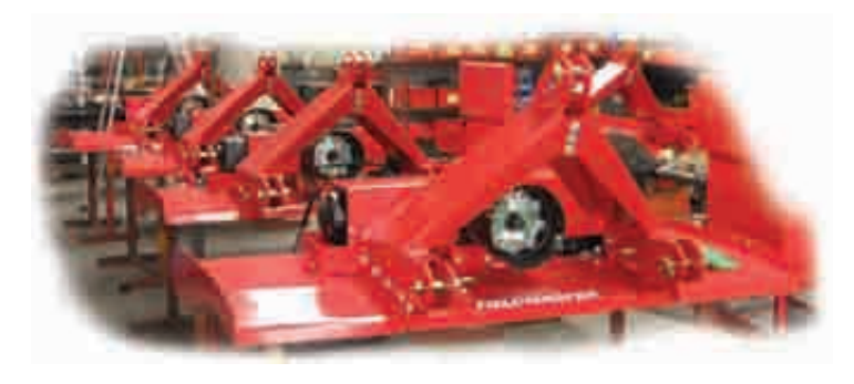
YOUR AUTHORISED FIELDMASTER DEALER IS: