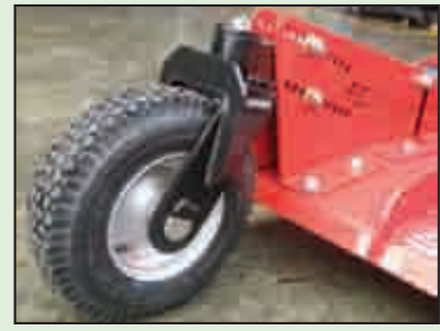
Heavy duty puncture proof semi-swivel wheels have spring returns to maintain and assist tracking and castor position.