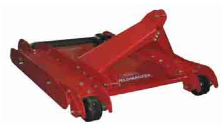
MX60 with front and rear roller (FL bearings) and side panels.