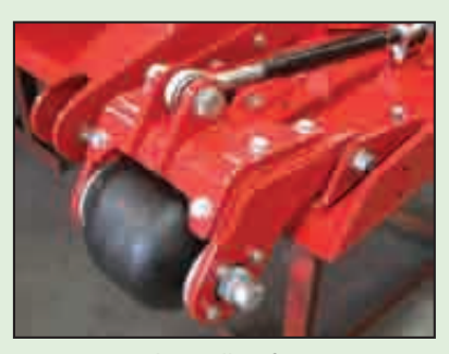
XHD Heavy duty rollers feature taper roller bearings for long life to endure extreme conditions. All rollers are 220mm diameter.

Gearmower model XHD is a market leader! Available in side discharge and rear discharge configuration, the XHD boasts numerous extremely rugged build features that are designed to last for years and years. XHD has been designed and tested and proven for years in the most rigorous, demanding and punishing environments of today's large vineyards. Proven and recommended by the large corporate vineyard owners, as a machine that can be left to the demanding operator who wants speed, action and NO downtime!