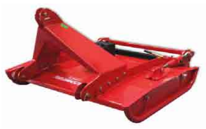
MX60 with skids & optional upgraded HD rear roller (with taper roller bearings)