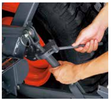
*Optional on B3150SU

Ratchet-type lift rod allows speedy adjustments to 3-point mounted implements. Lift rod adjustments can be made with ease.