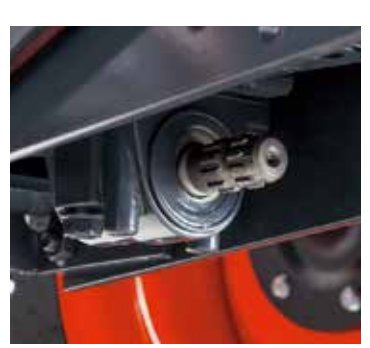
*Not available on B3150SU

The offset PTO allows quick installation and removal of the mid-mount mower.