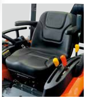
*Not available on B3150SU

The new suspension seat is specifically designed to absorb shock reducing operator fatigue to make your ride comfortable no matter what the conditions. Arm rests are standard equipment for added comfort.