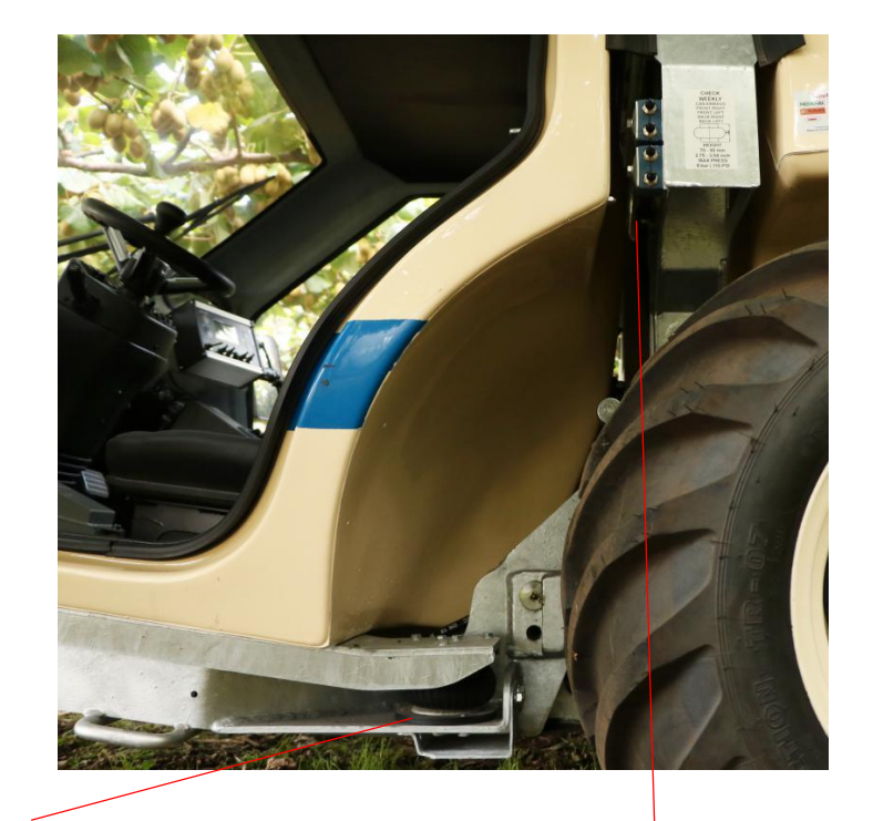
Air Bag suspension on all four corners of the cab.

Central Adjustment point of the cab suspension.