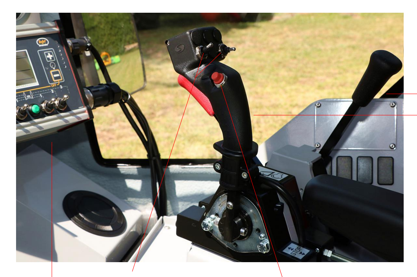
Left & Right Spray Controls

844AB Spray Controller For accurate chemical Application.